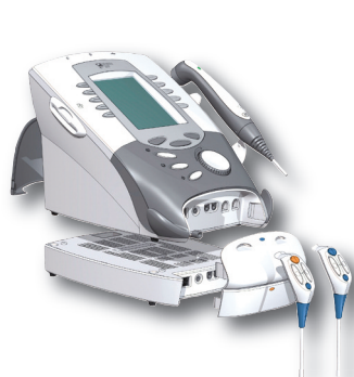
stim unit (left) combo unit: stim plus ultrasound (right) both shown with optional mobile cart