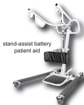
stand-assist battery patient aid