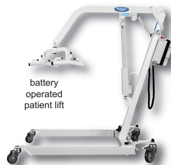
battery operated patient lift