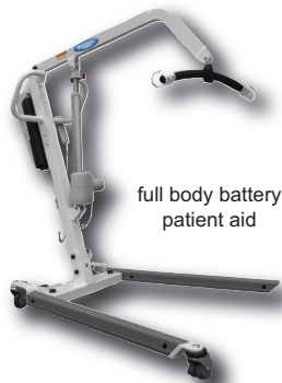
full body battery patient aid