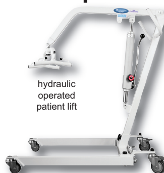
hydraulic operated patient lift