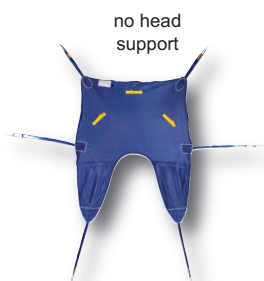
no head support