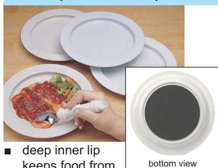
plate with inner lip