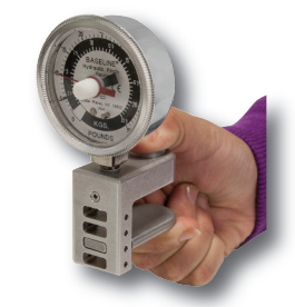
5-grip width can accommodate large hands