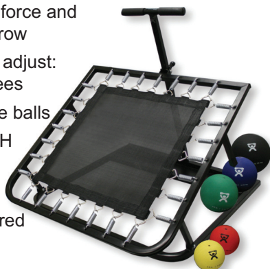
rebounder with 5 PT balls