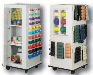
supplies sold separately