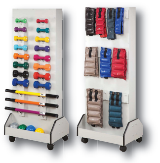
supplies sold separately