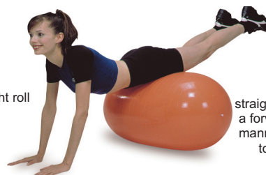
C straight roll

straight roll only moves in a forward and backward manner making it easier to use than a ball